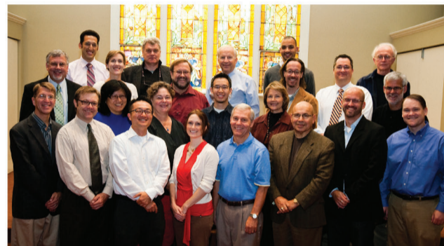
School of Theology faculty and staff.